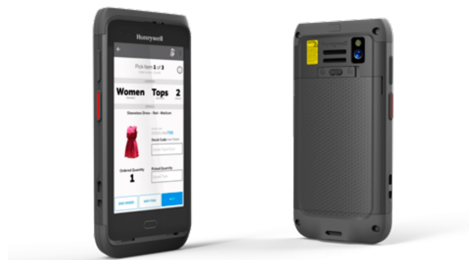
CT40 Mobile Computer

Task duration: 20% less with connected Retail Solutions