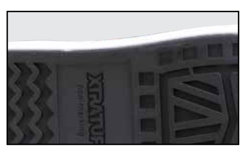
SRA NON-MARKING, SLIP-RESISTANT CHEVRON OUTSOLE