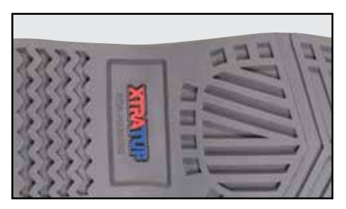
SRA NON-MARKING, SLIP-RESISTANT CHEVRON OUTSOLE