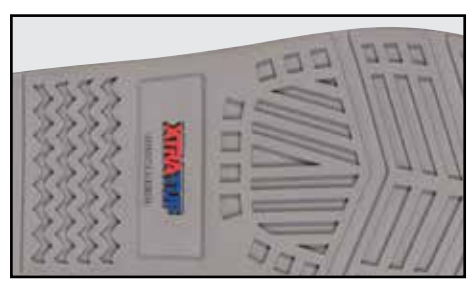
SRA NON-MARKING, SLIP-RESISTANT CHEVRON OUTSOLE