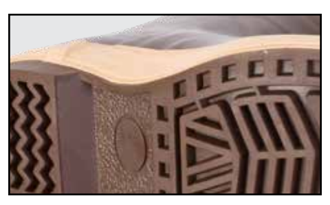
SRA NON-MARKING, SLIP-RESISTANT CHEVRON OUTSOLE