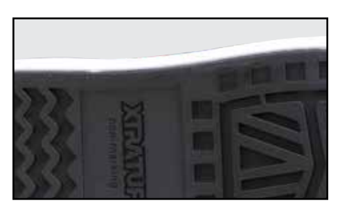
SRA NON-MARKING, SLIP-RESISTANT CHEVRON OUTSOLE