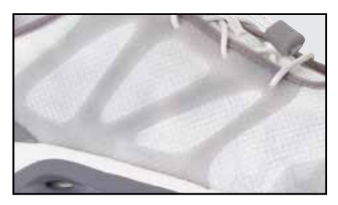
100% BREATHABLE QUICK DRY MESH

Anglers are athletes and to perform at their best they need the proper footwear. Whether you're the wire man, poling the flats or throwing swimbaits the Spindrift provides all day comfort in an athletic silhouette. Perforated molded EVA insole paired with the drainage outsole make this shoe an anglers daydream. All XTRATUF footwear features our signature non-marking, slip-resistant Chevron outsole.