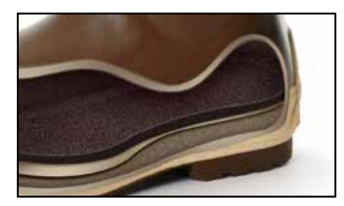
POLYMERIC FOAM INSULATION