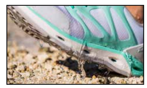
PERFORATED EVA INSOLE & DRAINABLE EVA MIDSOLE