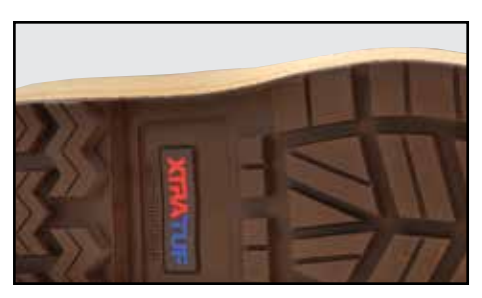
SRC NON-MARKING, SLIP-RESISTANT CHEVRON OUTSOLE