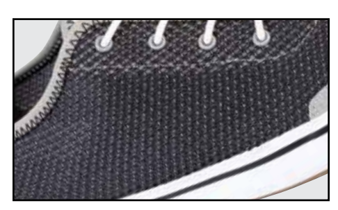
BREATHABLE QUICK DRY MESH