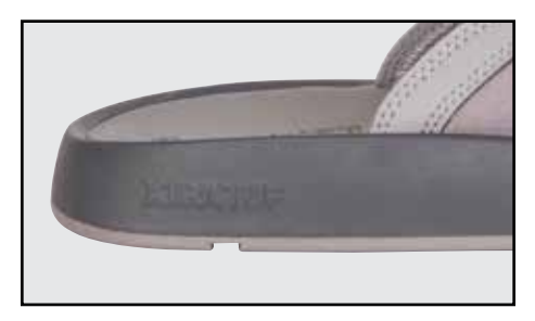
TRIPLE DENSITY BOTTOM FOR COMFORT

Flip-flops are often times the preferred footwear of choice for many warm water anglers. It's important the choice of flip-flop keeps the angler in the shoe and provides sure footing. The North/South Shore features XTRATUF's signature non-marking slip-resistant outsole, the same sole featured on our iconic Legacy boot. The molded foot cradle holds your foot in the flip-flop while the Chevron outsole keeps you sure footed while you fight the fish on the other end of the line.