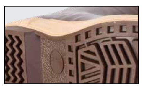
NON-MARKING, SLIP-RESISTANT CHEVRON OUTSOLE