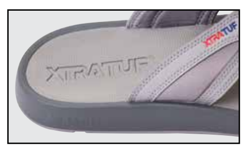
FOOT CRADLE FOR STABILITY