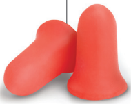
Max Foam Earplugs