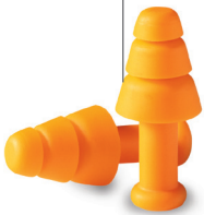
SmartFit Pre-Molded Earplugs